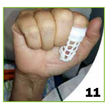
Inform your patient to mobilise PIP joint fully.