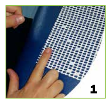
Measure width of splint needed by adding a row of rectangular openings to the width of the finger. Average length of splint = 15 holes.