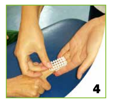
Fold X-LITE<sup>®</sup> material over the top end of the finger. Keep a gap on one side of the splint to allow for adjustments. Use the stretch of the material to help lift the end of the finger.