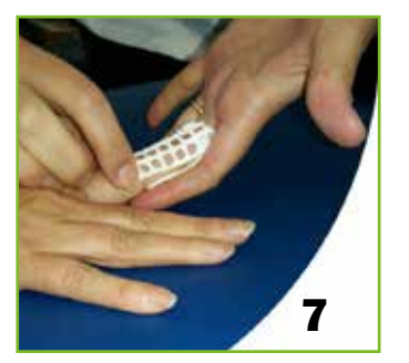
Use your palm to position the DIP joint to neutral or hyperextension. This will distribute the pressure evenly.