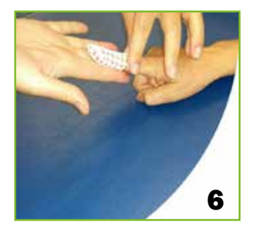
Position the splinted finger in neutral or hyperextension using pressure along the volar side. Don't push on the fingertip as this may cause a pressure area.